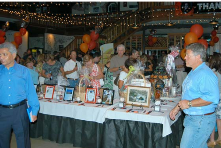
Over 200 auction items and raffle prizes were donated by generous community members, businesses, friends and family. The event raised $80,000 to be used for scholarships and charities.